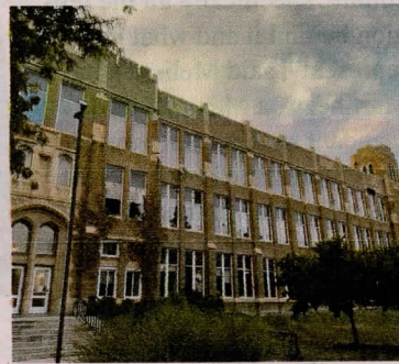
Chicago Academy High School in 2024.

He explained that the bathrooms had an outside space