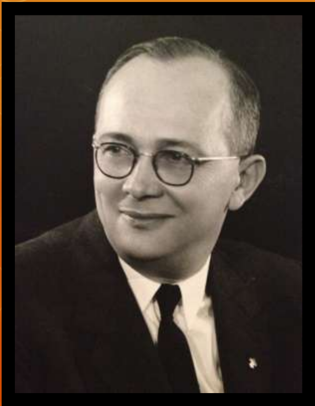
My great grandfather