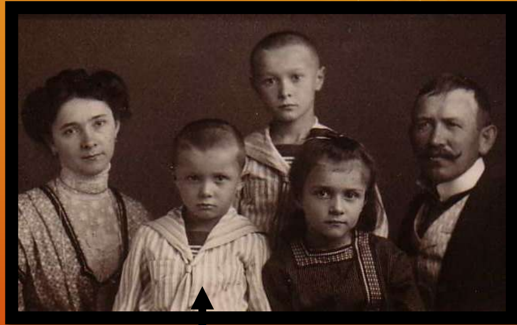
My Great Grandfather as a boy in Hungary with my great-great- grandparents